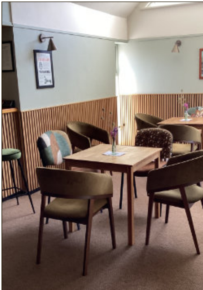
The refurbishment of the Clubroom at The People's Hall is well on its way to being finished.

We'll be open right through the school holidays and although we don't have the space for running around, children of all ages are very welcome!