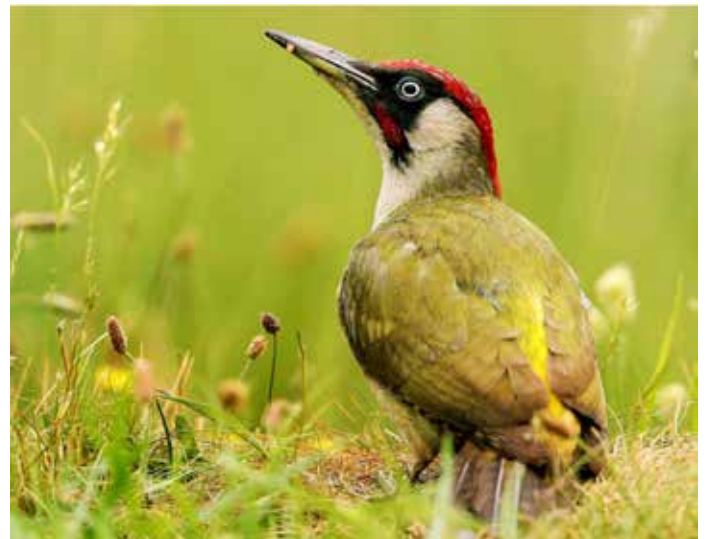
The Green Woodpecker Picus viridis

What will you 'observe' in the coming days? Why not stop for a moment and take time to breathe in the multitude scents in the air, hear the many birdsongs, see the emergence of new flowers, the unfurling of leaves on the trees. There's so much to see, to feel, to hear, to smell with the coming of warmer days.