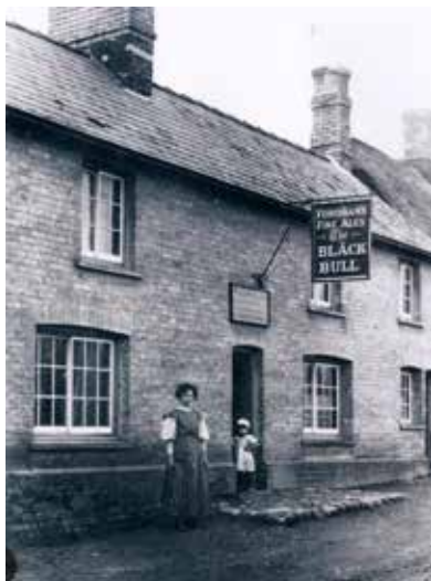
The Black Bull